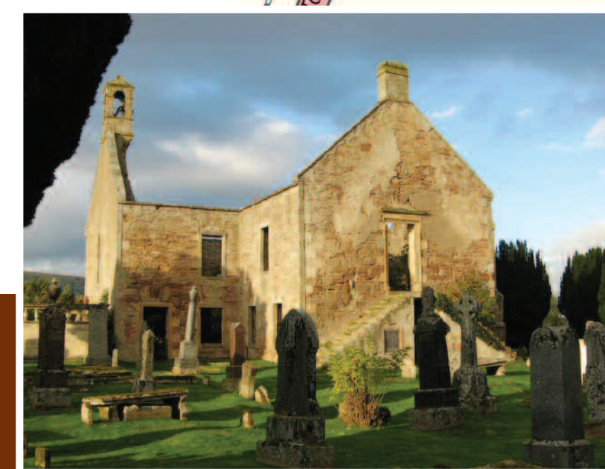
Kiltearn Old Kirk

In 2017, the Evanton Community Trust carried out a project to improve and upgrade sections of these paths, which are marked in colour on the map.